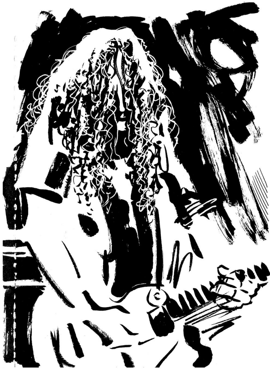
Garrett Sweeny - Atomic Bitchwax The Underworld. 23/07/22