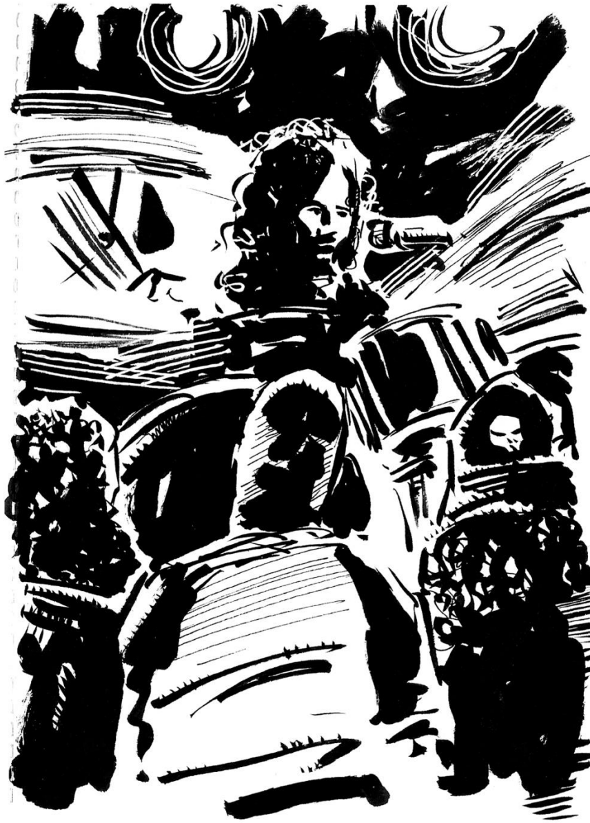
Matt Ainsworth - Trevor's Head The Underworld. 23/07/22