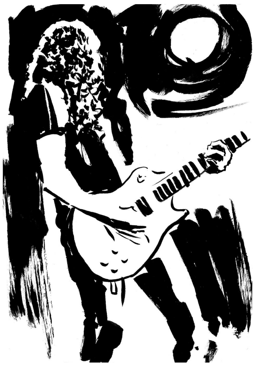
Garrett Sweeny - Atomic Bitchwax The Underworld. 23/07/22