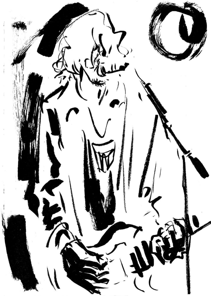
Eddie Glass - Nebula The Underworld. 23/07/22