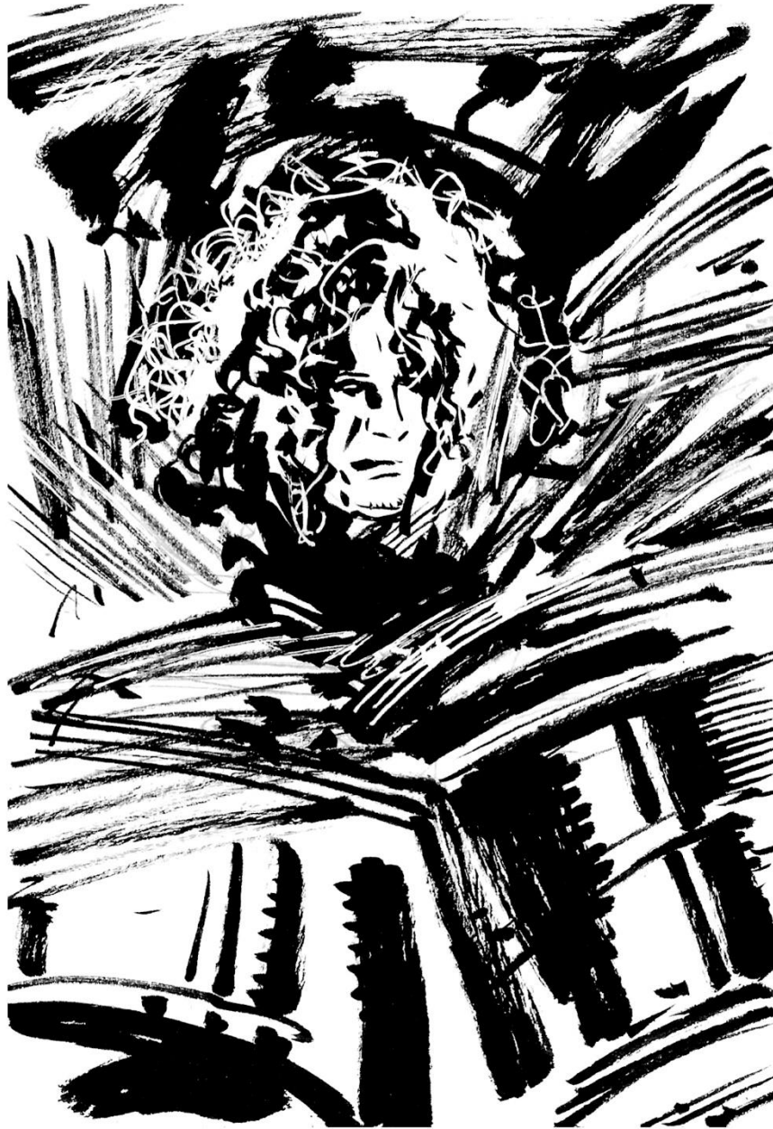
Bob Pantella - Atomic Bitchwax The Underworld. 23/07/22