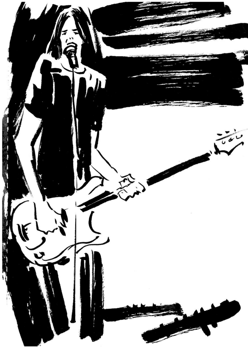
Chris Kosnik - Atomic Bitchwax The Underworld. 23/07/22