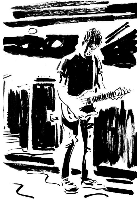
Nebula. The Underworld. 23/07/22