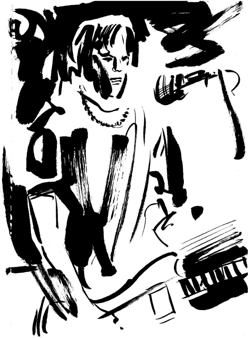
Tom Davies - Nebula The Underworld. 23/07/22