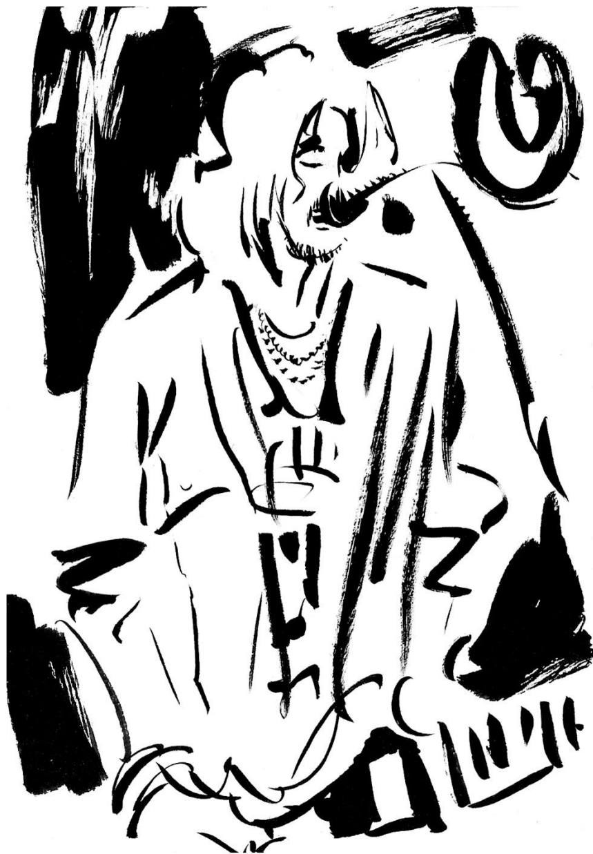
Eddie Glass - Nebula The Underworld. 23/07/22