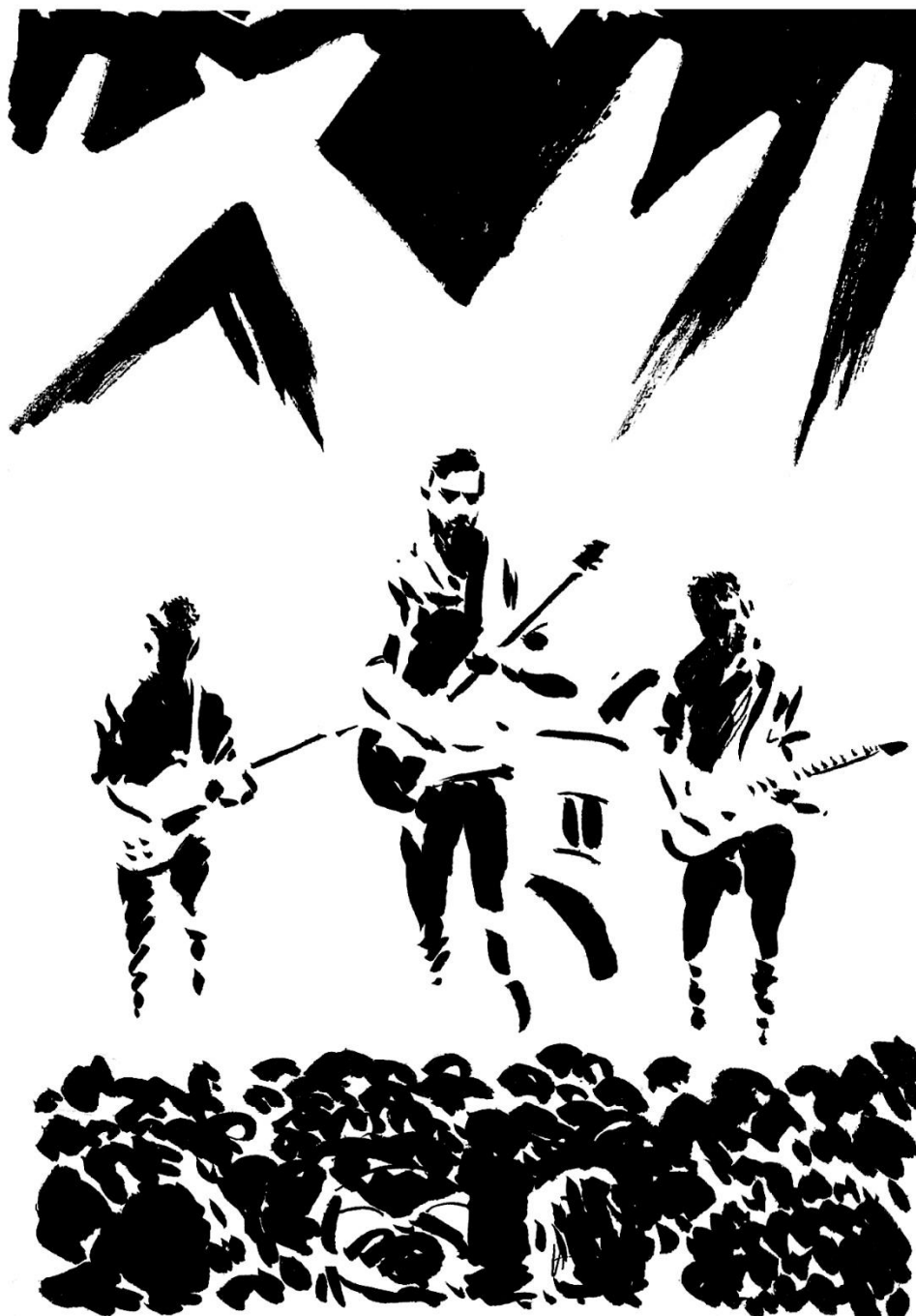
Lowrider. The Electric Ballroom. 29/04/22