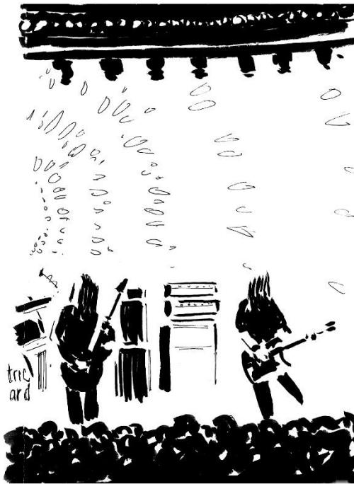
Electric Wizard. The Roundhouse. 01/05/22