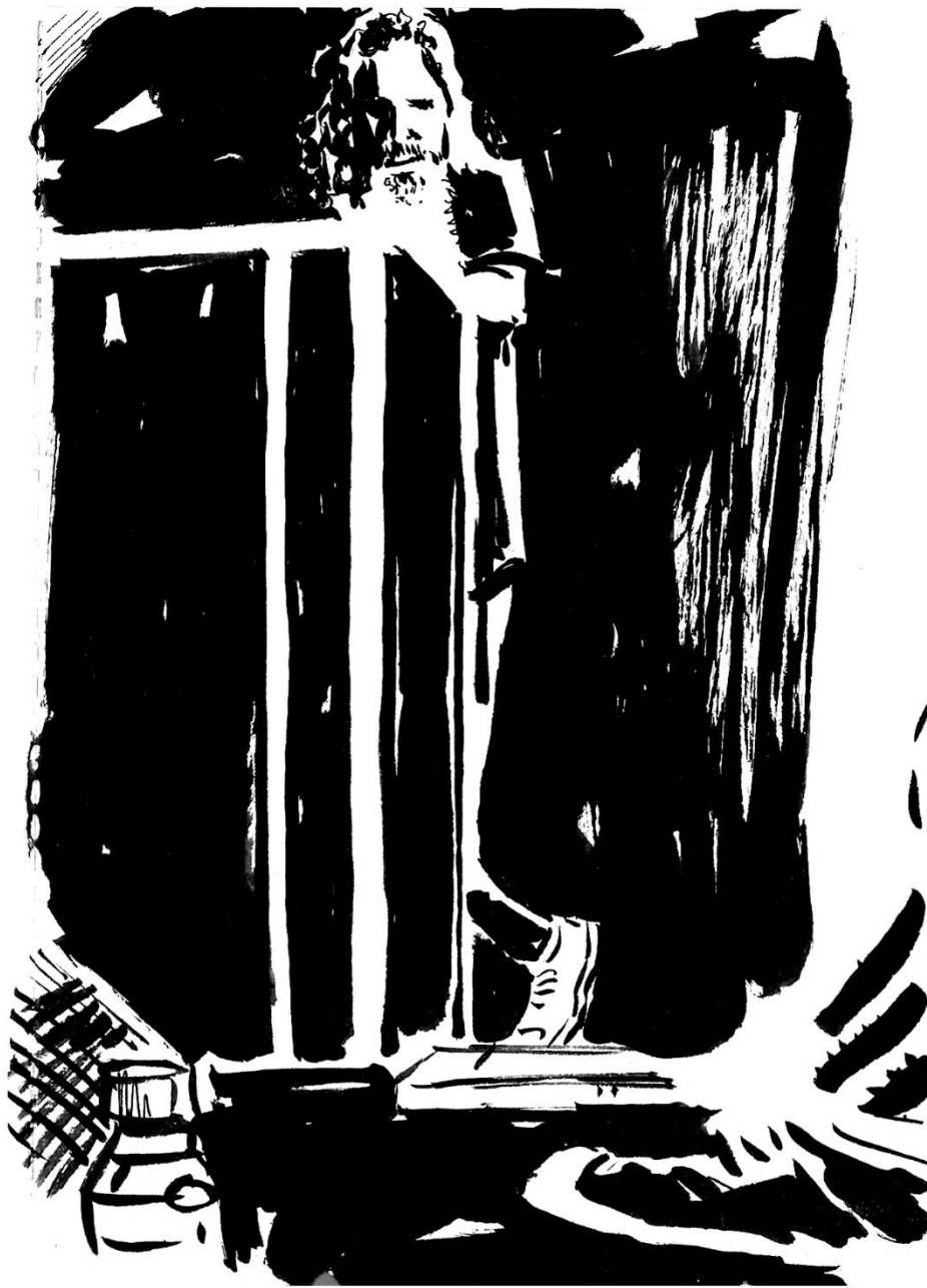
Oliver Hill. The Underworld 01/05/22