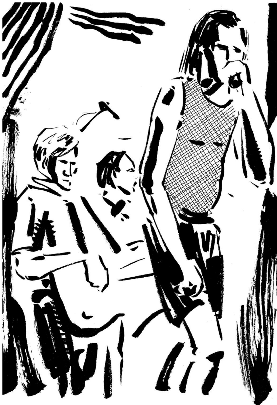
Pissed Jeans. The Roundhouse. 30/04/22