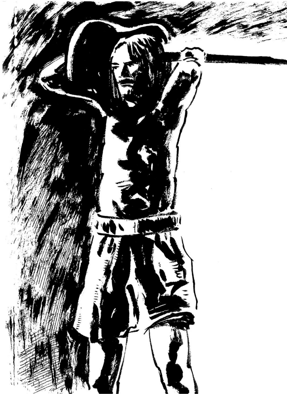
Niklas 'Dango' Källgren - Truckfighters The Electric Ballroom. 29/04/22