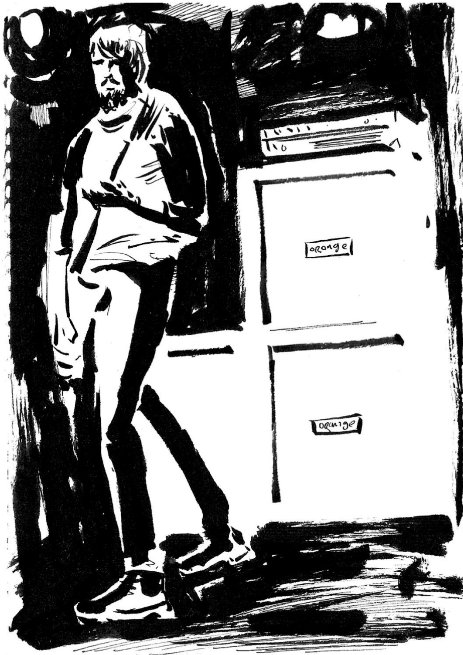
Morag Tong. The Underworld 01/05/22