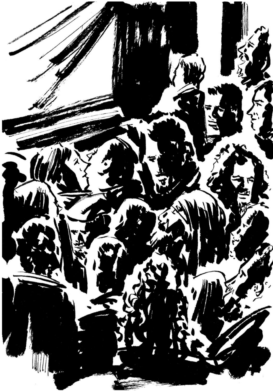
Audience. The Underworld. 01/05/22