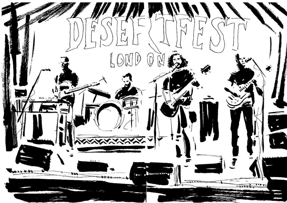
Elephant Tree. The Roundhouse. 30/04/22