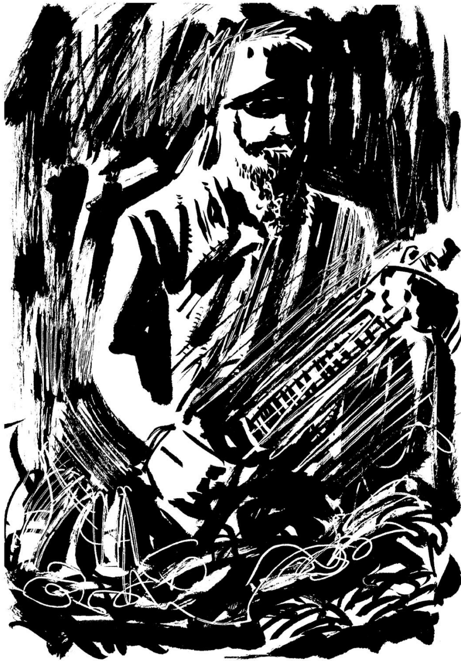
Jimmy Bower - Eyehategod The Roundhouse 01/05/22