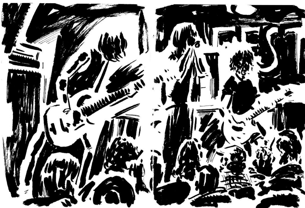
Blind Monarch. The Underworld. 29/04/22