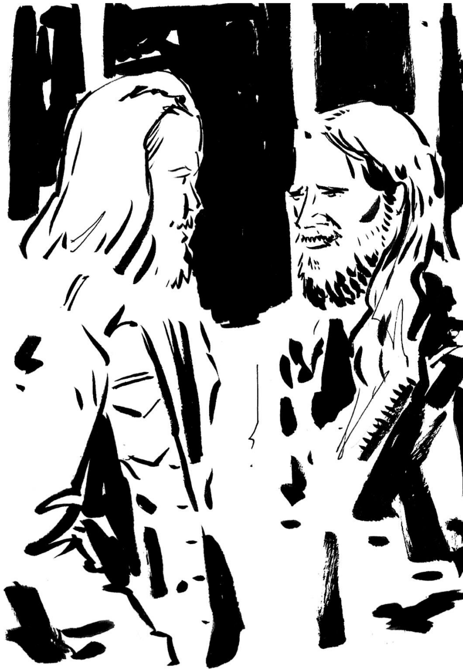
Conversation. The Roundhouse. 01/05/22