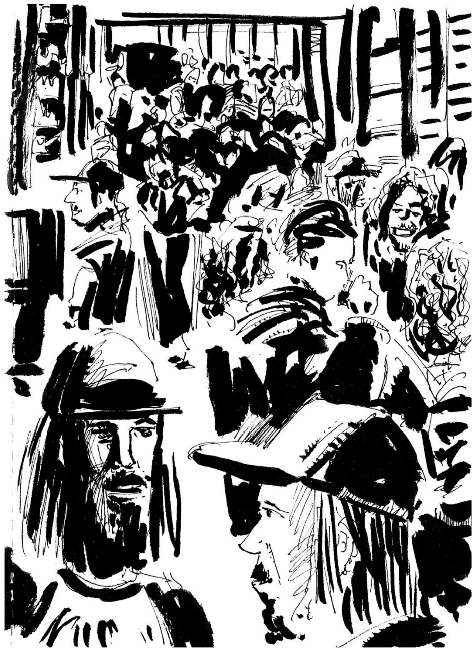
Outside The Black Heart. 01/05/22