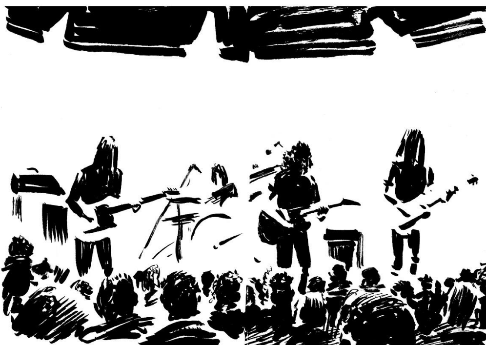
Elder. The Roundhouse. 30/04/22