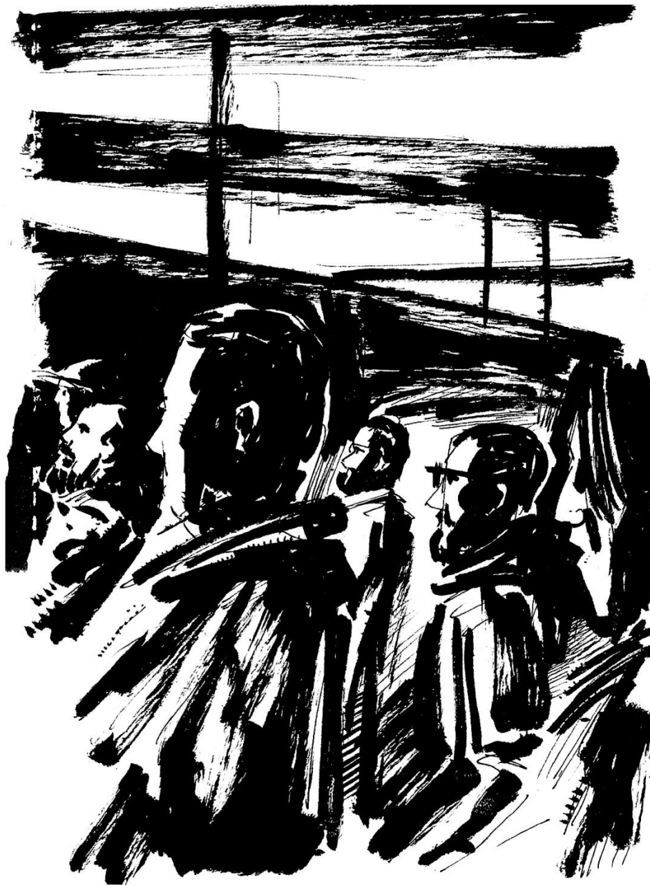
Audience. The Roundhouse 01/05/22