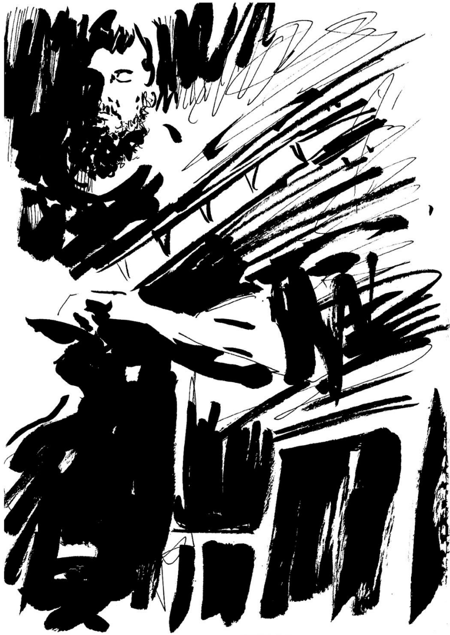
Morag Tong. The Underworld 01/05/22