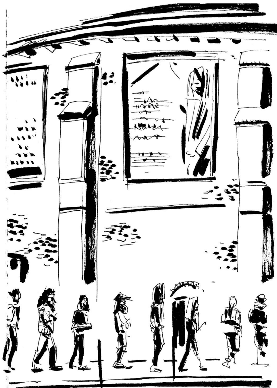
Morning queue. The Roundhouse. 30/04/22