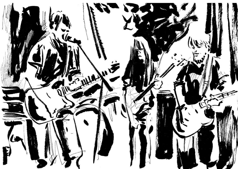
Part Chimp. The Roundhouse. 30/04/22