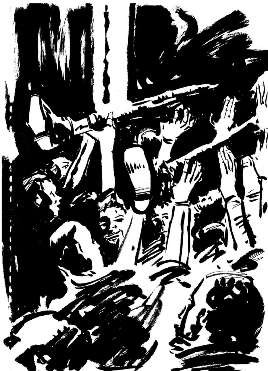
Crowd Surfer. The Underworld. 01/05/22