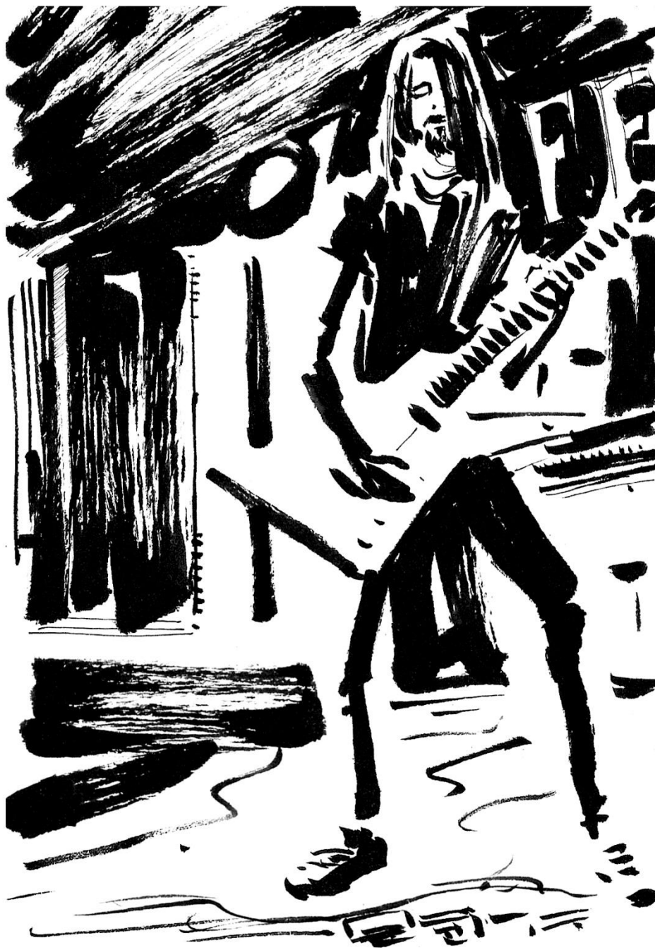
Morag Tong. The Underworld 01/05/22