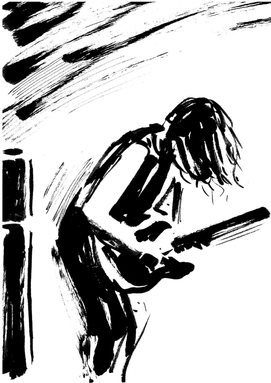
Aaron Rieseberg - Yob. The Roundhouse 30/04/22