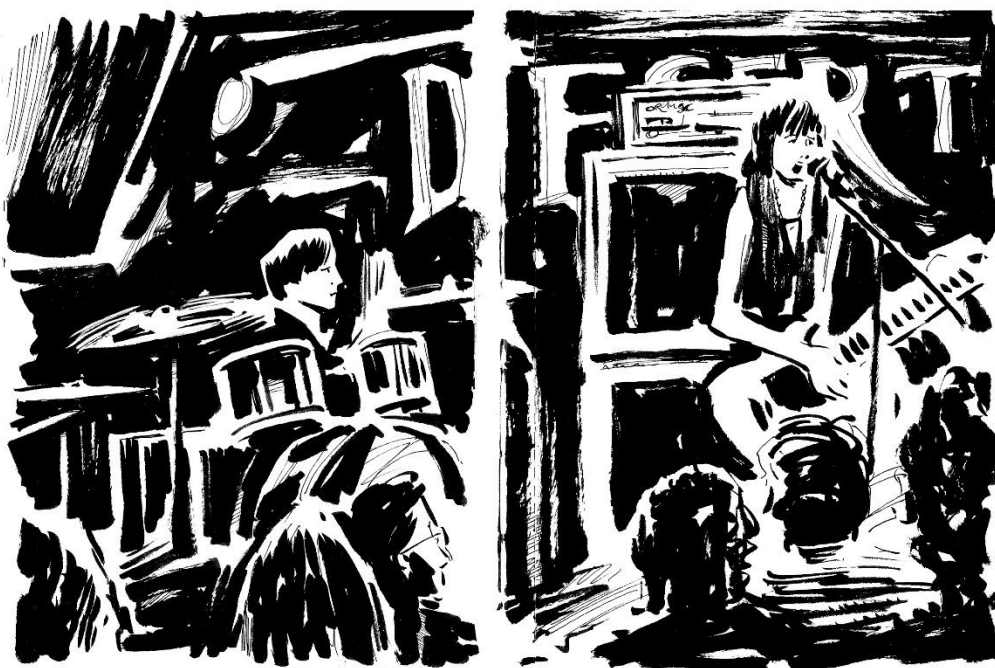
Black Lab. The Underworld. 29/04/22