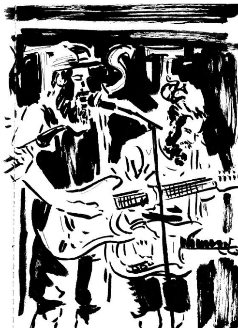
Ten Foot Wizard. The Underworld. 01/05/22