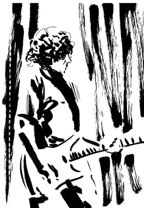
Shellac. The Roundhouse. 30/04/22