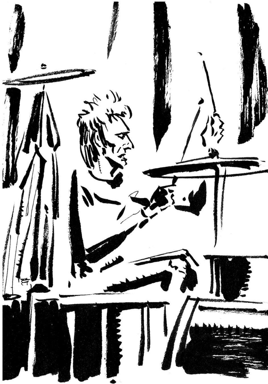
Todd Trainer - Shellac. The Roundhouse 30/04/22