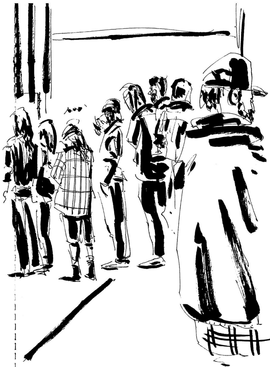
Queue. The Dev. 29/04/22